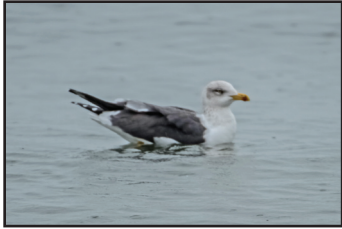
Lesser Black-backed Gull